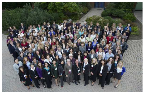
WiN Canada's 7 th Annual Conference : Group picture

Presentations and pictures from the event can be found at www.wincanada.org .