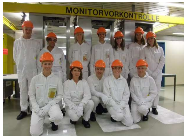
Women in Nuclear (WiN) provides mentors for students studying nuclear engineering at Uppsala University

On the second day, the Swedish participants visited the nuclear power plant “Krümmel” in Geesthacht close to the river Elbe. Through discussions with the on site staff they could get an idea of the situation of nuclear energy in Germany. A guided tour through the plant and a following lunch in the information center of “Krümmel” completed the event. After these two enriching days, all participants agreed on another meeting between WiN Germany and Sweden next year to expand the network of “Women in Nuclear” and to further learn from each others experiences.