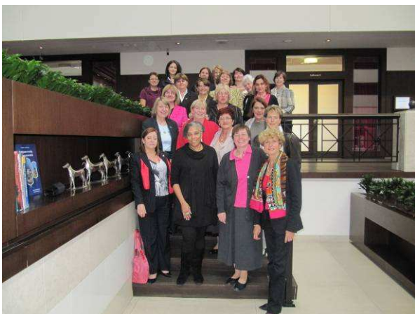
Meeting of the founding members of WiN Europe in Budapest